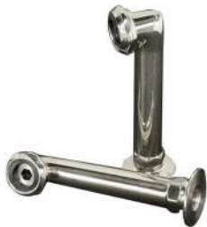
6" Elbow Mounts

BP Polished Brass PN Polished Nickel CP Polished Chrome SN Brushed Nickel ORB Oil Rubbed Bronze